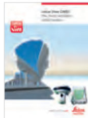
Leica Viva GNSS Product brochure