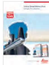
Leica SmartWorx Viva Product brochure