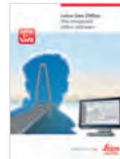
Leica Viva LGO Product brochure