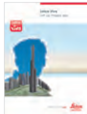
Leica Viva Overview brochure

Illustrations, descriptions and technical data are not binding. All rights reserved. Printed in Switzerland – Copyright Leica Geosystems AG, Heerbrugg, Switzerland, 2012. 804854en – XI.12 – galledia