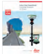
Leica Viva SmartPole Product brochure